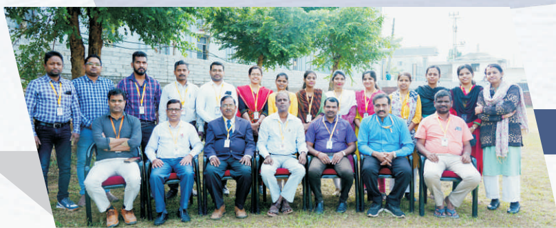
Our Beloved Teachers